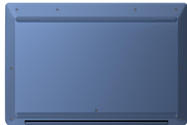
Powered by MediaTek Kompanio